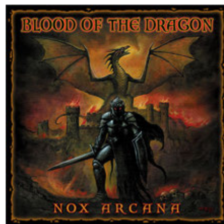
Blood of the Dragon

Don't beat yourself up over it. The vast percentage of people who own our CDs don't ever realize that there are puzzles and coded messages hidden in them. It started when we were developing Blood of the Dragon in 2006. I wanted to create a general quest that could be used by RPG Dungeonmasters who utilized our music for their games. I wrote the song "Treasure of the Four Crowns," which had lyrics about a fabled treasure that was hidden in ancient times, and then got the idea to hide the entire quest in the CD, utilizing the booklet, packaging, disc and music to conceal the clues. Part of the lyrics to the song state that a cryptic key to finding the treasure is concealed beyond a black barrier behind the Dark Lord's throne. The back of the CD case shows a dark warrior sitting in a black throne.