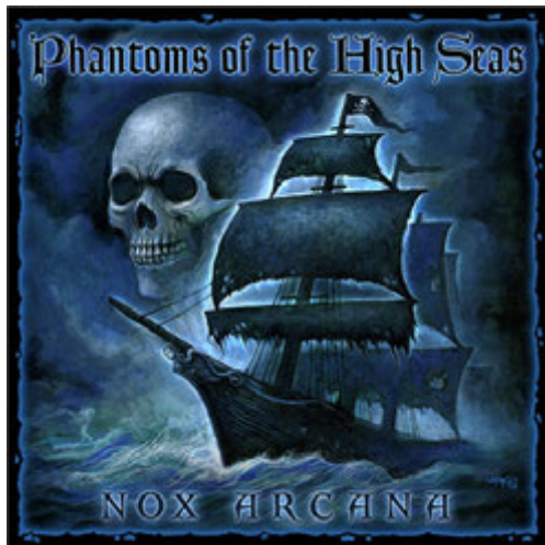
Phantoms of the High Seas, Nox Arcana's Tenth Studio Album

Actually, since it wasn't that long ago, tell us a little bit about the process of creating Phantoms of the High Seas also. How do you have the time to produce such a frequent output of new music?