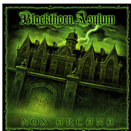
Blackthorn Asylum, the new album from Nox Arcana

No, the well is far from dry. We still have a substantial list of album ideas and we add to it every year. Most of our future CDs will be based on original concepts that pay homage to classic horror themes. We also get a lot of suggestions from our fans, who offer some really good ideas. I love to be able to make my dreams, and nightmares, a reality.