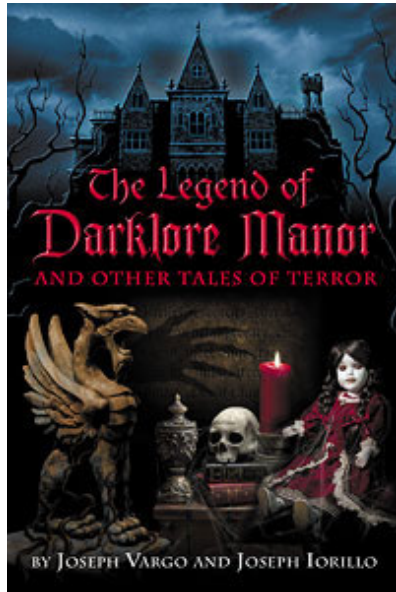
The Legend of Darklore Manor and Other Tales of Terror

Speaking of Darklore Manor , tell us a little bit about the book for those who may not be familiar with it.