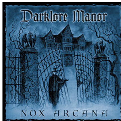
Darklore Manor, the first album from Nox Arcana

We have a lot of variety in our themes, so we like to alternate the concepts of our releases between horror and dark fantasy. We have a long-term goal for Nox Arcana and we're always plotting what our next few CDs will be well in advance. If we write a melody or song that doesn't exactly fit the theme of our current album, we save it for a more appropriate CD before we develop it. We've held back on some really good songs for several CDs simply because they conveyed a different mood than the one we were creating at the time. Because of this, we now have an extensive library of original songs and melodies that are waiting in the wings for future concepts.