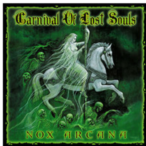
Carnival of Lost Souls

I know it's only May, but any idea where we might be able to hear your music this October? Have you already been in talks with any amusement parks? I know, locally, I was pretty upset to hear "The Dark Knight" soundtrack at Busch Gardens in Virginia, instead of Nox Arcana music.